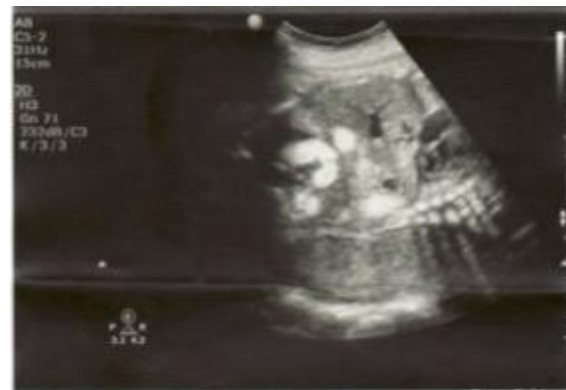
Figure 1. Ultrasonographic imaging of hyperechogenic colon.

Delivery occurred at 40 weeks, and a 38000 g, 52 cm male newborn was born with an Apgar score of 9/10. After birth, the urine was tested for cystinuria and the diagnosis was confirmed on the fifteenth day after birth.